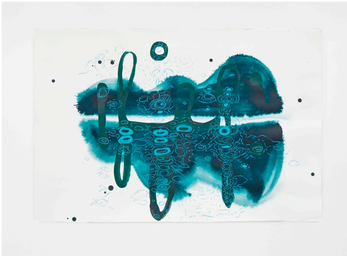
Hydromedusa , 2014 Mixed media on watercolour paper 66.04 x 103.5 cm