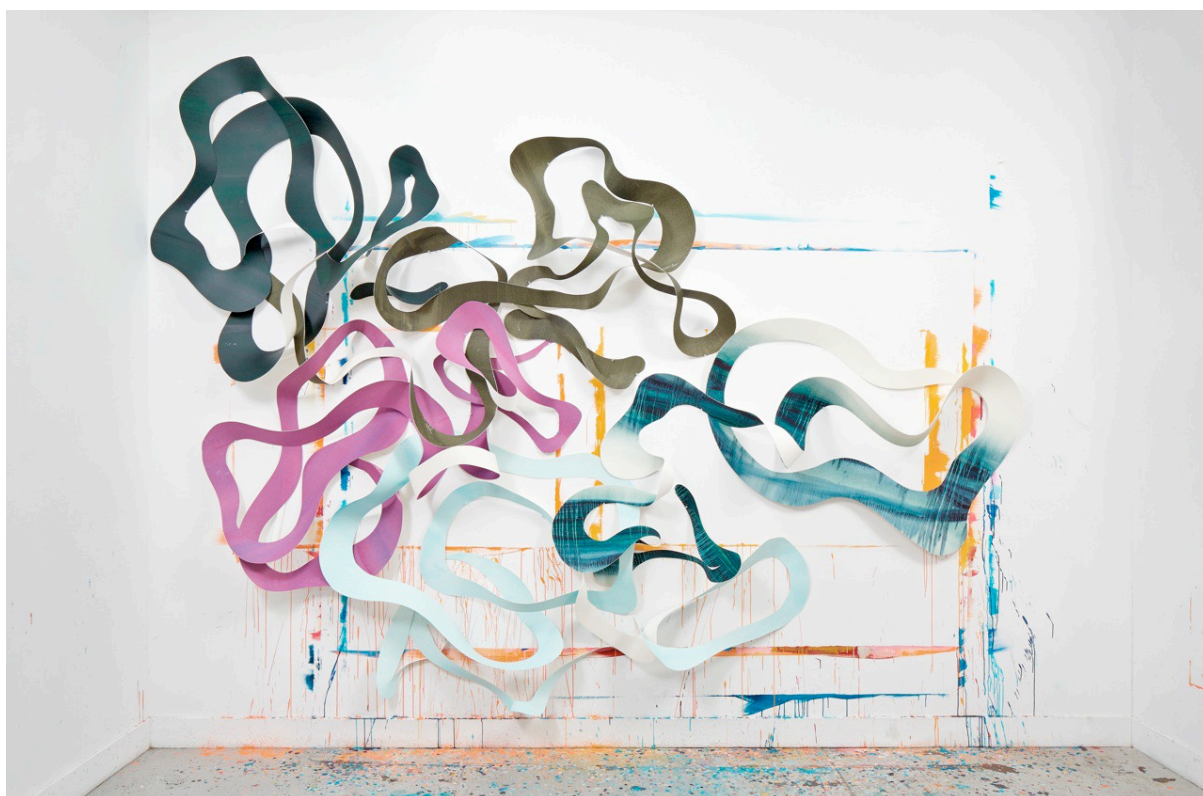
Ocean Study II , 2014 Watercolour and acrylic on watercolour paper 308.19 x 414.66 cm