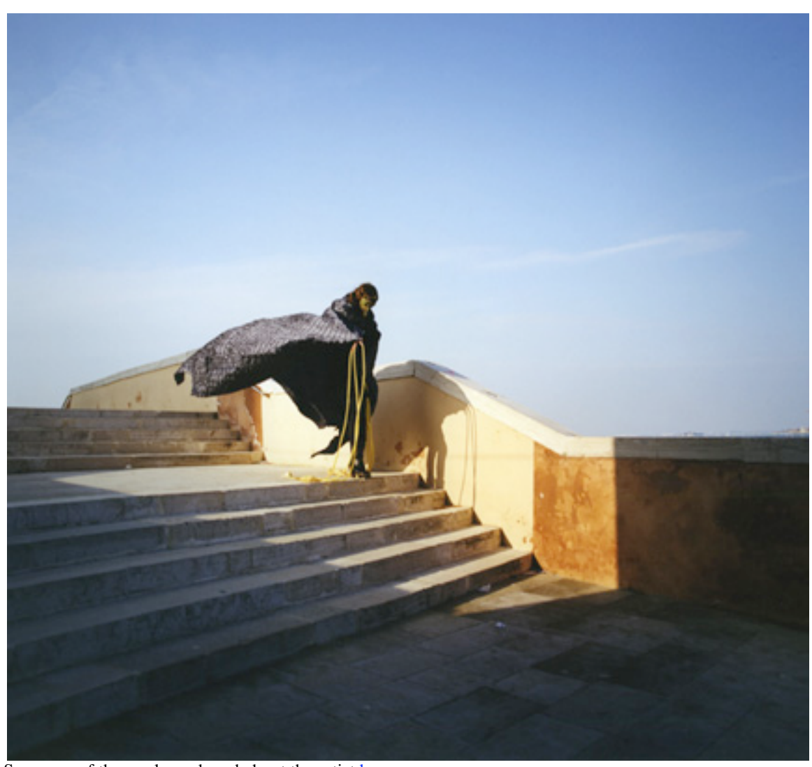
See more of the works and read about the artist <u>here</u>.

http://www.anyonegirl.com/art/janaina-tschape-acqua-alta/